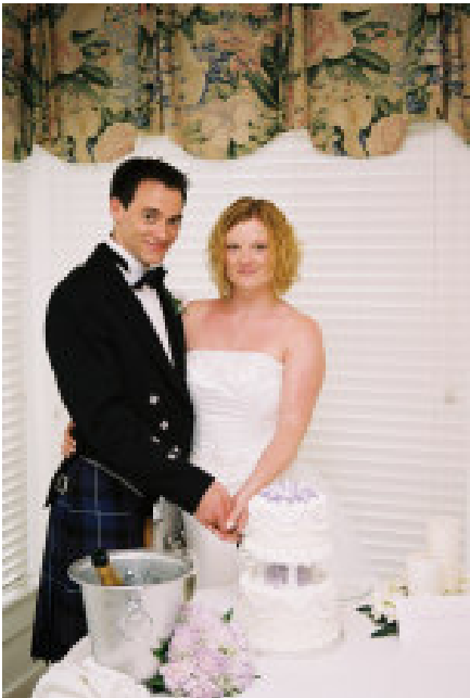
The bride and groom in traditional pose.

Campbell has posted up a series of colour and black and white pictures of his wedding at http://wedding.adrift.org.uk/ for us to look at.